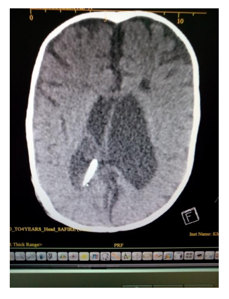
Fig 4: CT brain of the patient after the shunt at birth

Vol. 4, Issue 1, pp: (149-153), Month: January - April 2017, Available at: <a href="www.noveltyjournals.com">www.noveltyjournals.com</a>